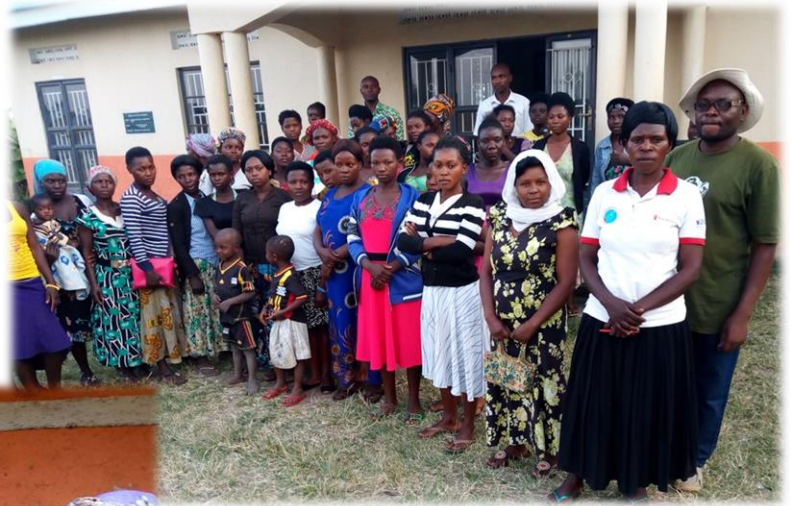
PLANE officials & teen mothers pose for a photo after training in reproductive health issues and nutrition of their children