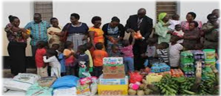
Kabarole district chairperson and PLANE staff donate to Tooro Babies Home

Separately - PLANE in partnership with Kabarole district launched a campaign to raise funds through the Family Clinic radio talk-show to buy goodies for Toroo baby’s home. The campaign was embraced by our listeners.