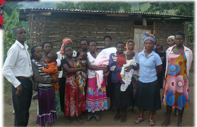
Teenage Mothers and PLANE staff pose for a photo after empowerment training