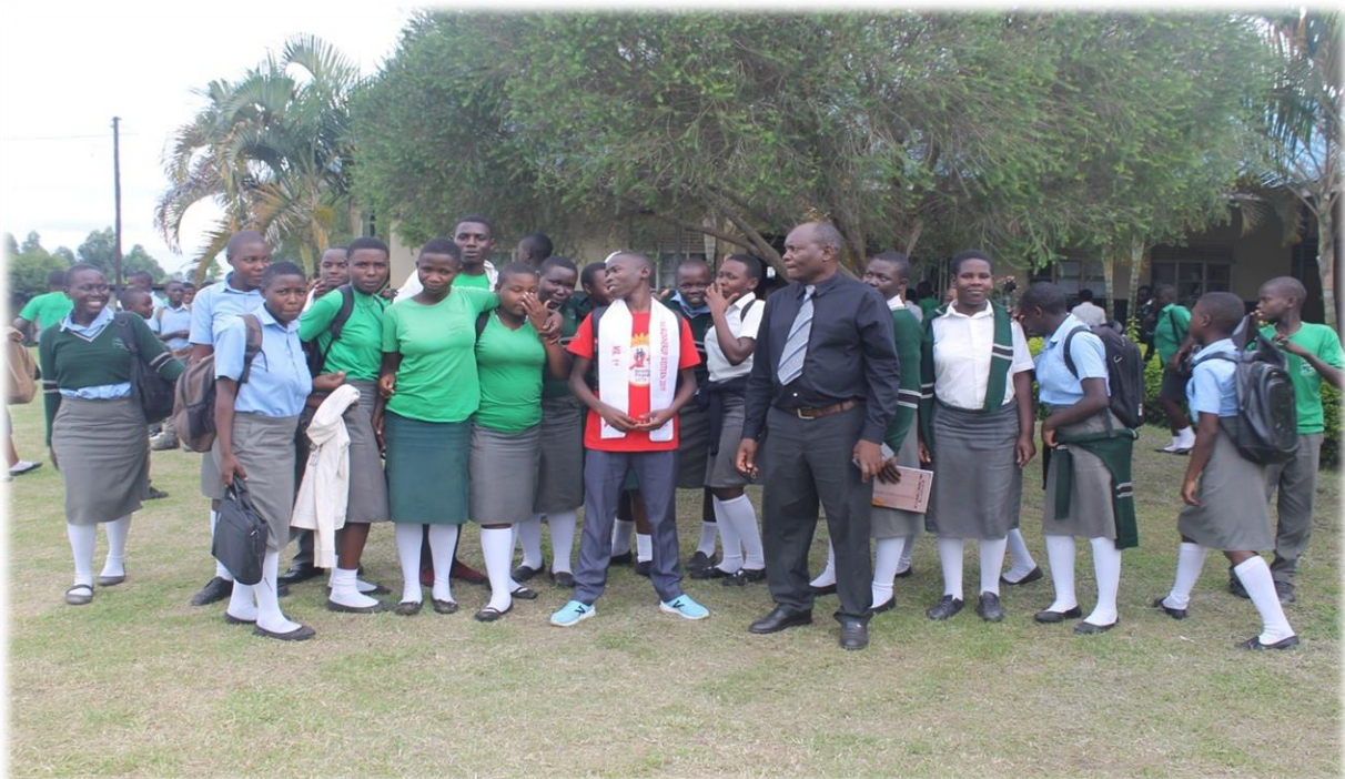
President Y+, PLANE Director & Kagote Sec Students-SRHR Guidance