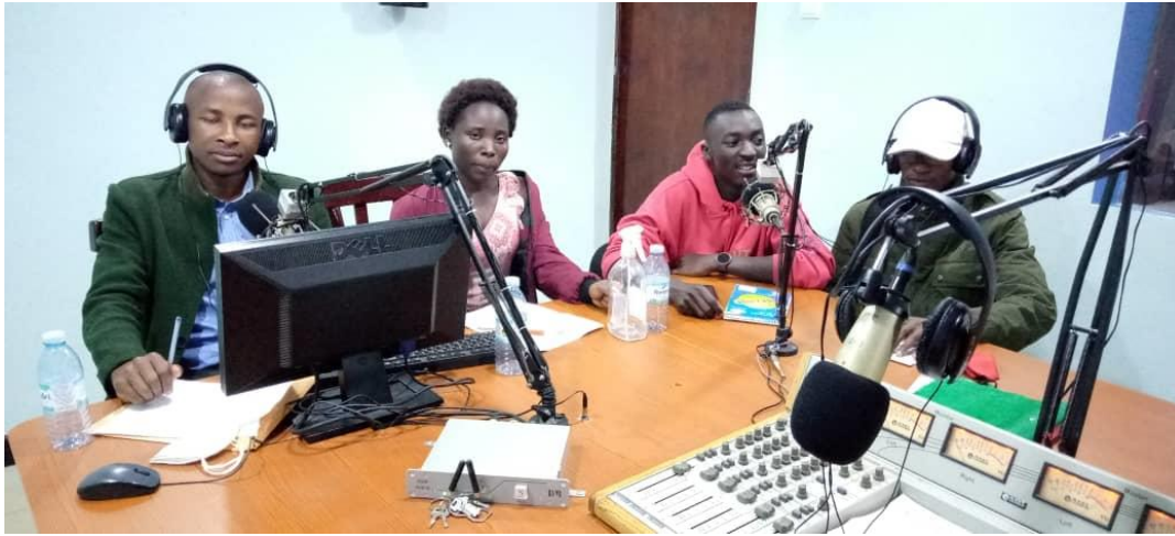
Family Clinic Radio Talkshow on Mitigation of Gender Based Violence and Domestic Violence