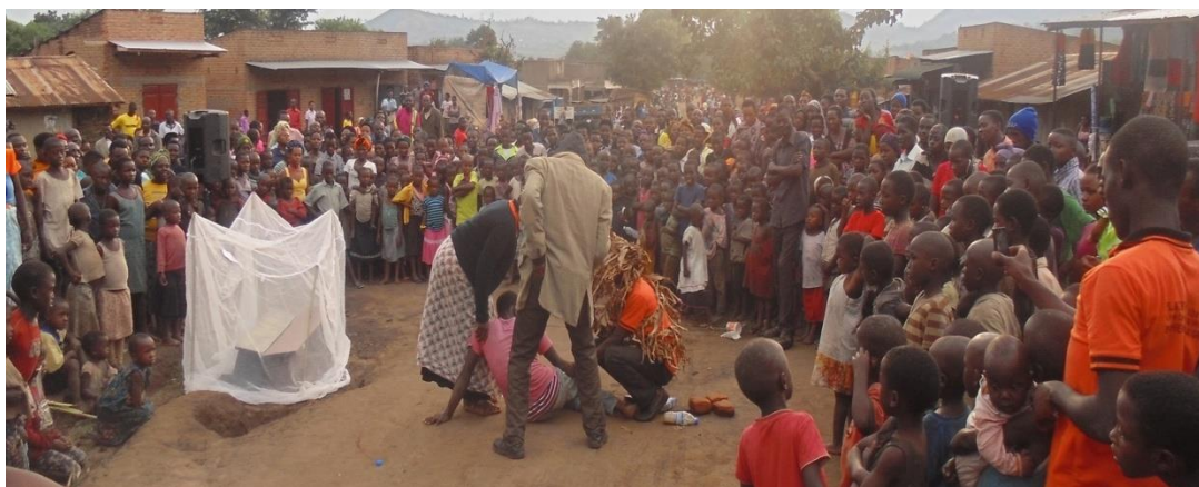
Drama performance on Malaria prevention. Play depicting malaria mistaken for witches in Kasenda rural sub county Kabarole

The campaign dubbed: “ Community Campaign for Social Mobilization (CCSM) ” follows a survey indicating high cases of malaria as a result of poor utilization of the distributed mosquito nets in the rural areas of Kabarole and Bunyangabu districts. PACE contracted our drama to conduct outreach in communities and primary schools in these districts. It was aimed at creating awareness within the communities on malaria prevention and control. 52 schools and 61 communities were reached and sensitized on malaria prevention and control.