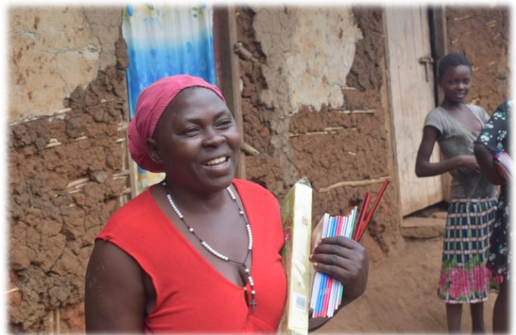
Happy widow after receiving scholastic materials for her child