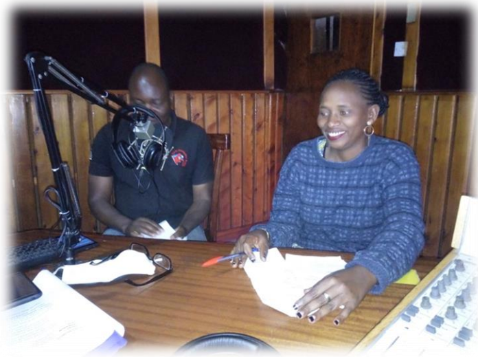
Family Clinic Radio talk-show on Family Planning

Youth hosted to discuss on Youth Unemployment and participation in gov't programs can reduce the problem.