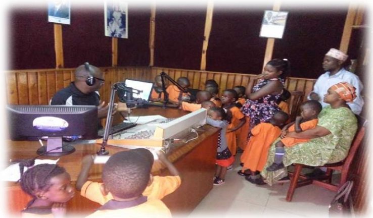
Child Rights Advocacy program. A Voice for the voiceless