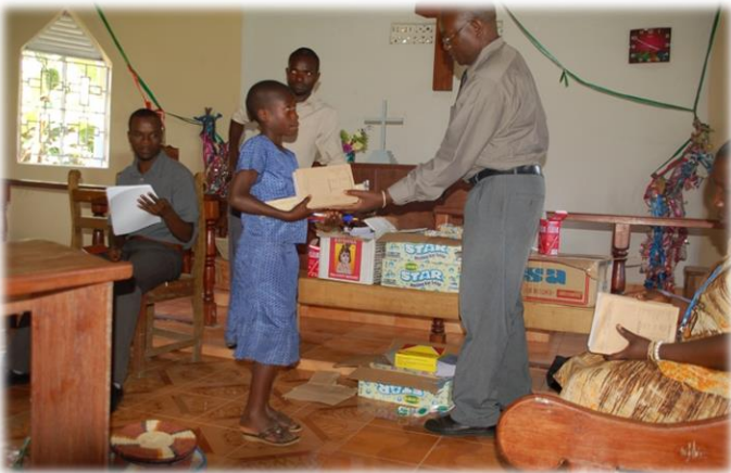
PLANE Officials distributing scholastic materials to orphans