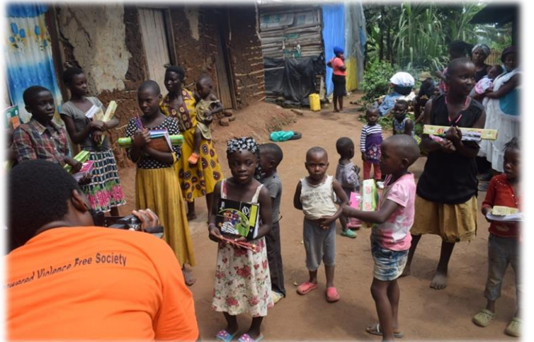
Children receive scholastic materials in Futi Butangwa, Fort Portal.