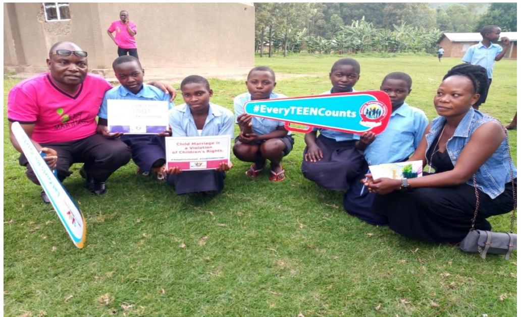
Every Teen Counts Campaign In Karangura Sub County, Kabarole District