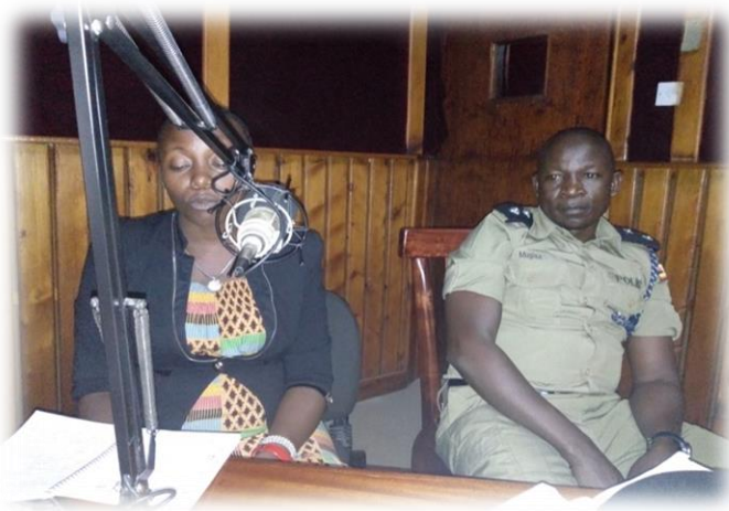
PLANE hosts Engabu Za Tooro and Tooro kingdom culture minister to discuss on how cultural deterioration has affected proper child upbringing.

PLATFORM for the NEEDY (PLANE) PLANE initiated the Family Clinic Radio Project. The talk-shows run every Monday from 10:00pm-1:00am on Voice of Tooro radio 101fmin Fort Portal City, Western Uganda. In these talk shows, PLANE hosts different resource persons to create awareness and educate the public on the rights of children, importance of education, land rights, youth and women empowerment programs, HIV/AIDS, family planning, domestic violence mitigation measures, good nutrition, and malaria prevention, among many other health and social issues.